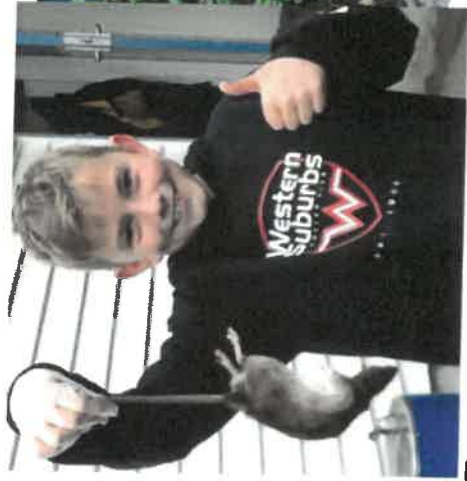
Pest Free Paramata Team