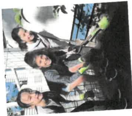
Vege patch kids