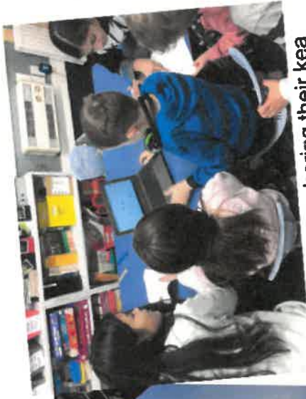
Yr 3&4 students sharing their kea gym gear with their Yr 7&8 buddies