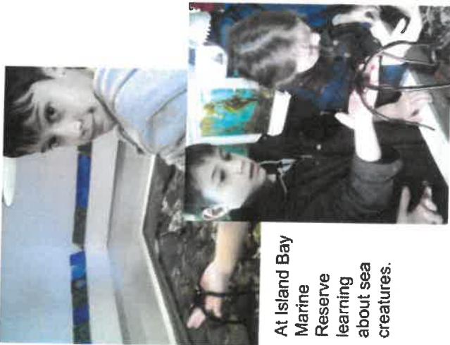
At Island Bay Marine Reserve learning about sea creatures.