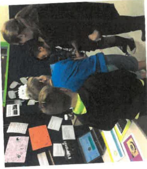
Sharing our Deeper Learning with our whanau/parents.