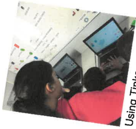
Using Tinkercad to make 3D models.