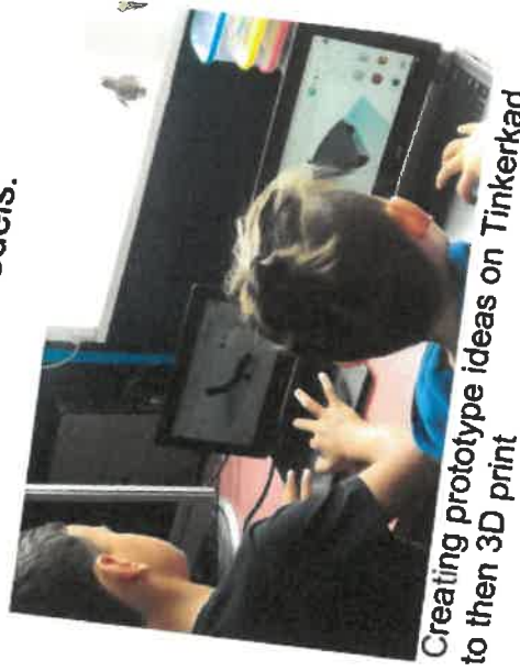
Creating prototype ideas on Tinkercad to then 3D print