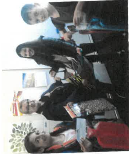
Room 7 refugee project.