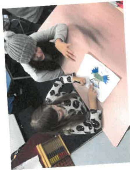
Yr 3 showing her big buddy her kea illustration for making a road sign