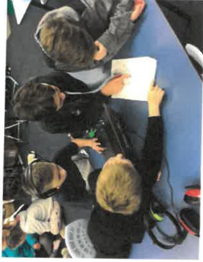
Yr 3&4 students sharing drone designs with their Yr 7&8 buddies.