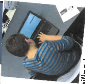
Emailing kea conservation to get more information about why the kea are the cheekiest bird.