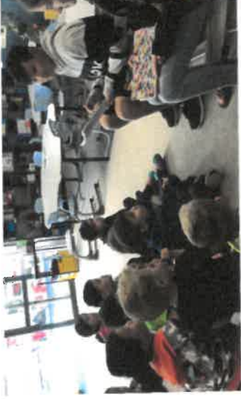
Rm 1b being interviewed by senior students about Sticky's Garden, for their project, a newspaper.

students teachers parents experts community