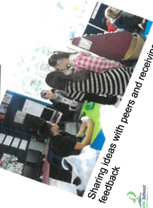
Sharing ideas with peers and receiving feedback