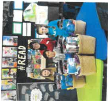
Arriving in Wellington to deliver kits to the Red Cross.