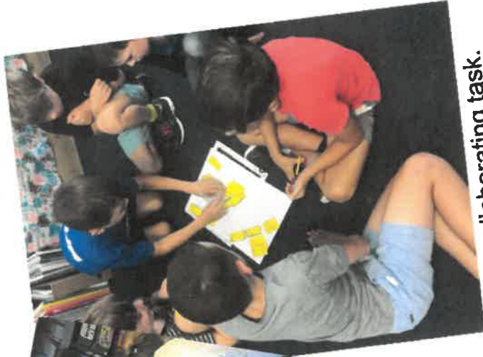
Yr 3&4 collaborating task.