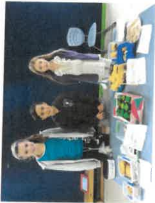
Red Cross Welcome Kit team ready to sell their baking to fundraise for their kits.