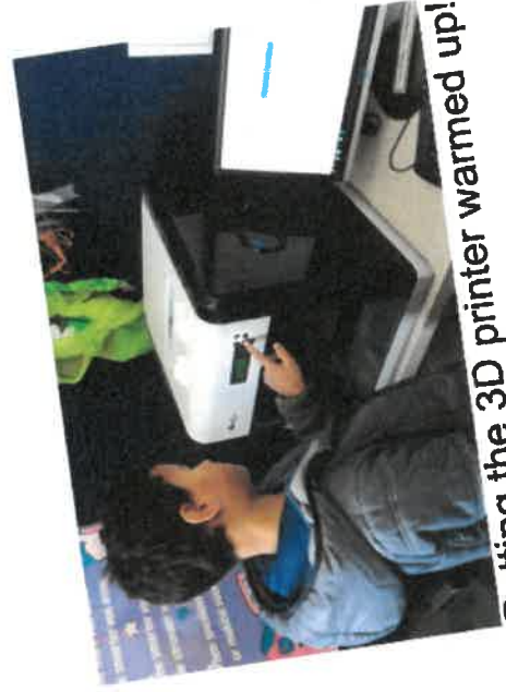
Getting the 3D printer warmed up!