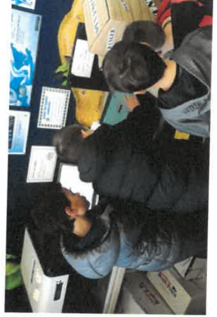
Y5&6 students sharing their knowledge of how the 3D printer works with Y3&4 students