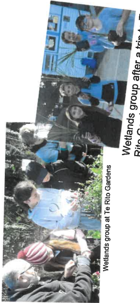
Wetlands group at Te Rito Gardens