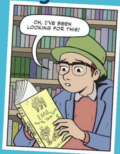
Image © Jonathan King – from The Inkberg Enigma (Gecko Press, 2020)