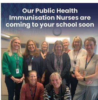
Our Public Health Immunisation Nurses are coming to your school soon

PROUDLY SPONSORED BY IGNITE INTERMEDIATES @ ST BARNABAS & LIFEWALK WELLBEING MENTORS