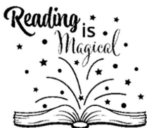
Paremata School Book Week 2024

Our very popular annual Book Week, is just around the corner. Embark on a wondrous journey through a magical world of stories and imagination. We will be celebrating the magic of books and the value of reading for pleasure and all the joys this can bring. There will be daily quizzes and activities, along with the annual “ Decorate Your Classroom Window ” competition running during this week.